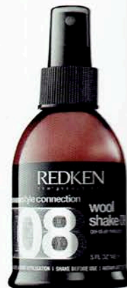
Vinyl Glam 02, $33; Contour 08, $33; Hardwear 16, $33; Forceful 23, $39; Wool Shake 08, $39