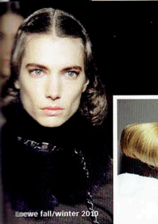
Loewe fall/winter 2010