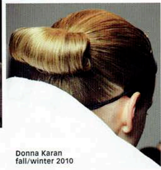
Donna Karan fall/winter 2010